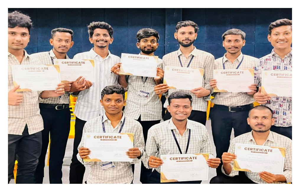
Learners with their certificates after the workshop on 6<sup>th</sup> of April, 2024