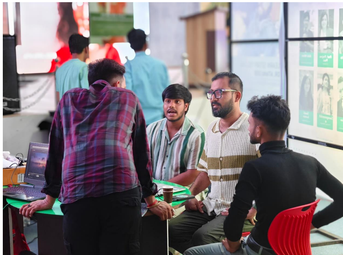
Resource Person reviewing learners interest and boosting critical thinking on 6^{\text{th}} of April, 2024